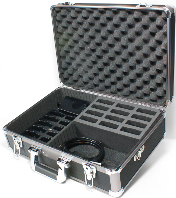
CHG 1012 PRO